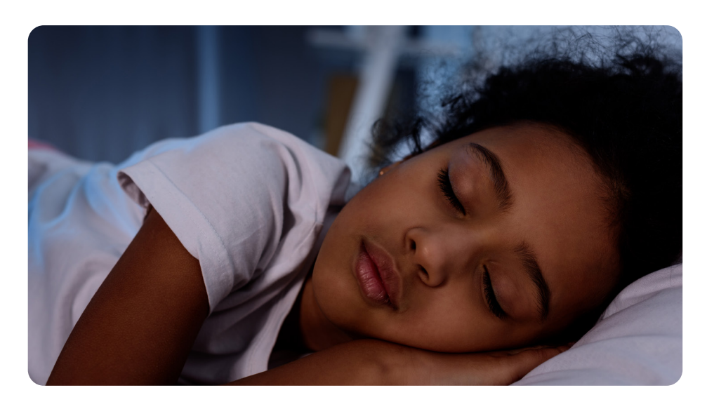
It is important to get a good night's sleep every night.