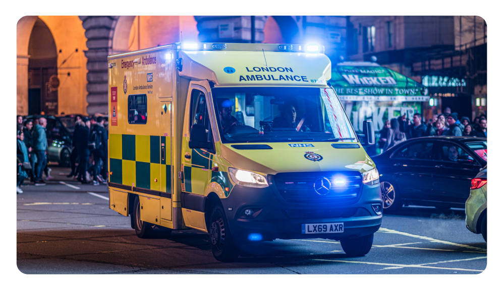
Some people work at night, like members of the emergency services.