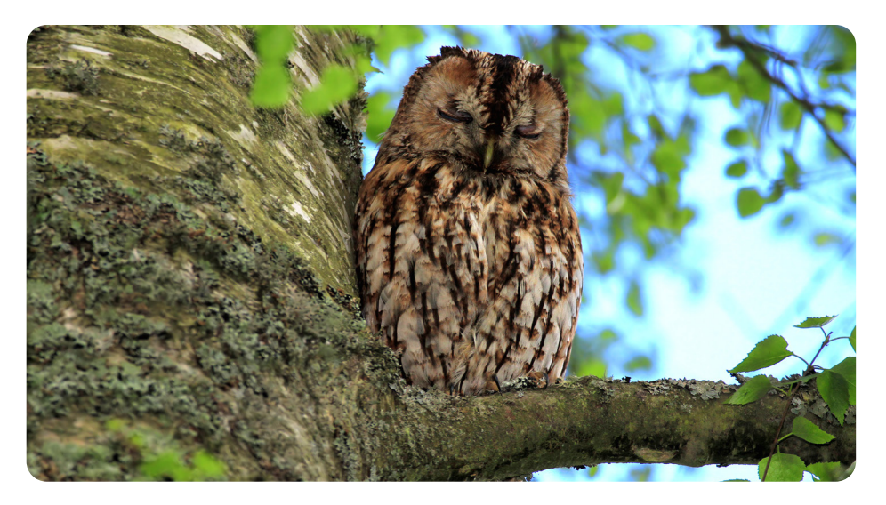
Some animals sleep in the day and are awake at night. They are known as nocturnal animals.