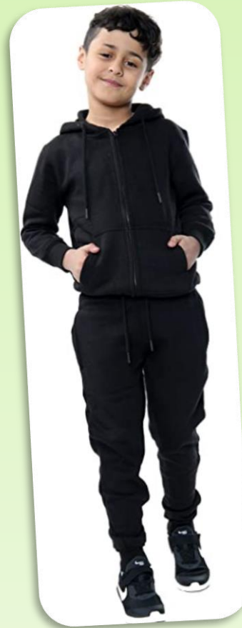
Black or grey tracksuit